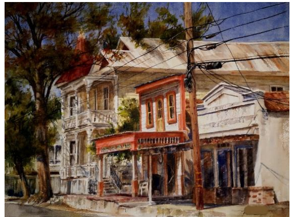
First Place Just for Show By Alyslynn Lemke