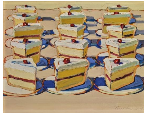
Boston Cremes By Wayne Thiebaud