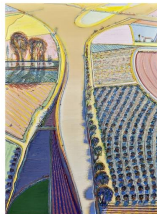
River Intersection By Wayne Thiebaud