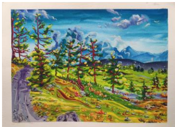
Down this Road By Shania Zhou