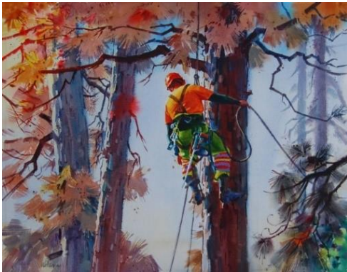
Best in Show 2020 Flying Squirrel 2 by Steve Walters

Reception will be held on Saturday, September 11 5:30-8:30 PM