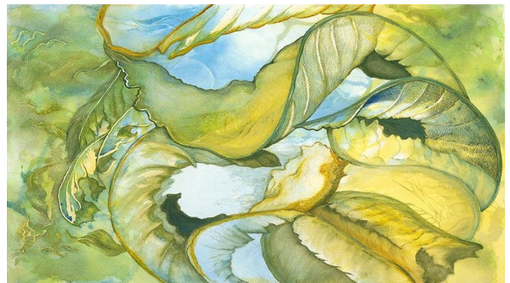
Leaves of the World2 by Karen Kramer

https://karenkramerart.com/lyrical-botanicals/