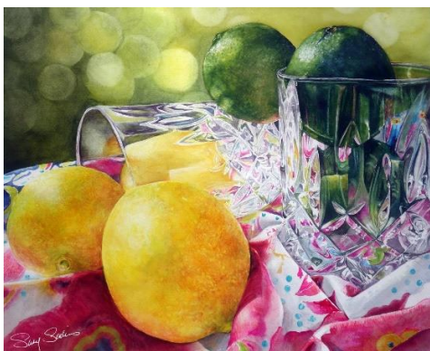
1 st Award of Excellence Squeeze the Day by Susie Soulies