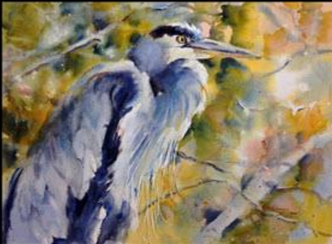
1st - Colleen Reynolds "Great Blue Heron"