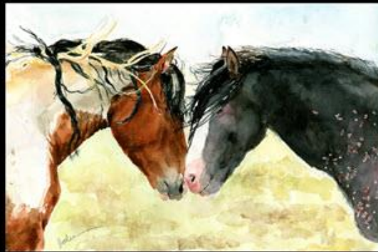
2nd - Galen Hazelhofer "Two Wild Horses"