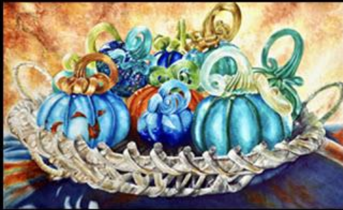
1st Place - Susy Soulies "Bibbidi-Bobbidi-Boo"