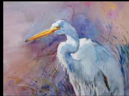
Colleen Reynolds "Great Egret"