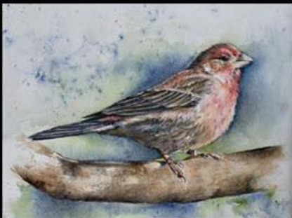
Billie Armstrong "House Finch"