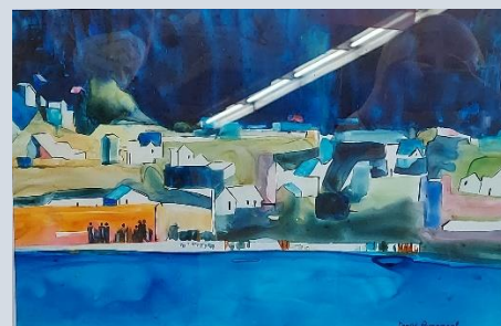
"Hillside Village" by Diane Pargament