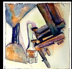
Opa's Gluing Table By Helen Plenert