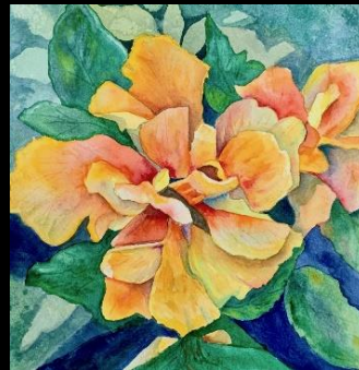
Yellow Burst By Karen Keys