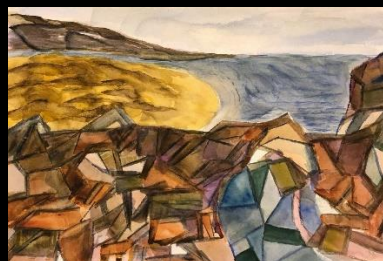
North Coast By Ain Veske