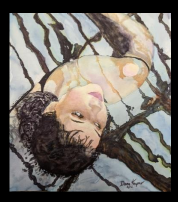
First Place: Untitled By Dana Karpow