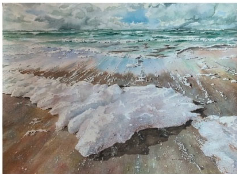
2023 Best of Show Chris Knopp - North Coast Surf

45th Annual Open Exhibition August 15th - September 9th